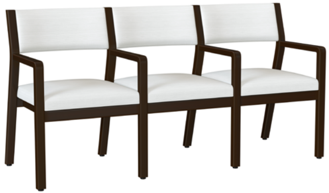
Model: CTEMT2GGG 67W 24.5D 33.75H 20SW 19SD 19SH 25AH

Caterina Multiple seating units by Kwalu offer a comfortable and versatile seating solution for hospital lobbies and medical waiting areas. These units come in various configurations, including two or three seats, connecting guest and bariatric chairs, in upholstered or slat-back styles. They are designed to accommodate both patients and their families, ensuring a shared comfortable experience. Add optional Caterina Linking tables for convenience.